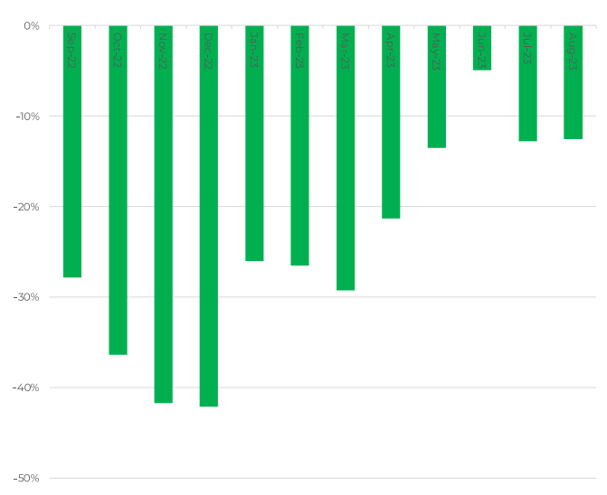
Rolling 12 Month Returns